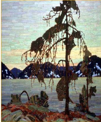
Jack Pine by Thompson