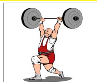
Weightlifting 举重 jǔ zhòng