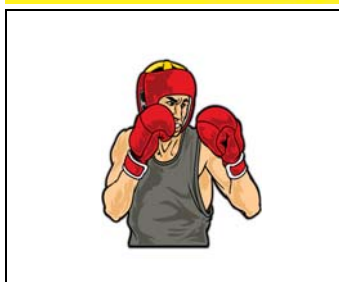
Boxing 拳击 quán jī