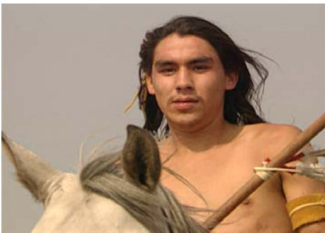
A BLACKFEET ENCOUNTER, FRIDAY, NOVEMBER 27 AT 1 PM ET.