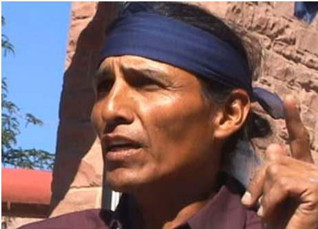
POWER PATHS ON INDEPENDENT LENS, TUESDAY, NOVEMBER 3 AT 10 PM ET.